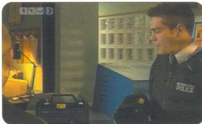
Pictured: The Bill's PC Harper uses an ultra-violet light to search for traces of SmartWater Index solution on a suspect's jacket.

Recently named 'Most Popular Drama' at the National Television Awards, The Bill is regularly viewed by almost 12 million viewers per week and is known to strive for realism when recreating police procedures and the use of police equipment. The inclusion represents a clear indication that the SmartWater Strategy has become an essential everyday tool in the fight against crime.