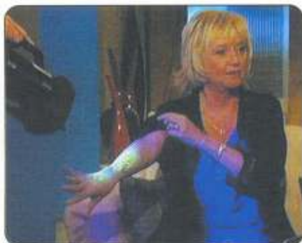
Judy Finnegan demonstrates SmartWater's Index solution with the help of an ultra-violet light, after trying in vain to wash it off.