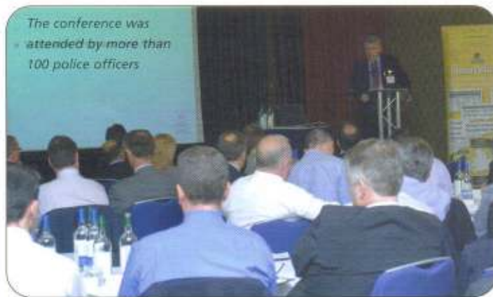
The conference was attended by more than 100 police officers