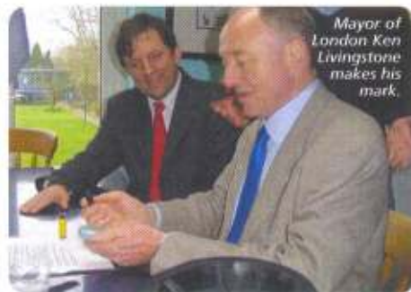
Mayor of London Ken Livingstone makes his mark.

The property marking initiative is due to be extended to the Pollards Hill, Figges Marsh, Ravensbury, Lavender Fields, and Colliers Wood areas of Merton later this year.